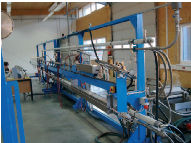
Figure 2: Magneto-focused plasma annealer control system

imperfections in the turbo-wheel, detection of rubbing between the turbo-wheel and cover as well as isolation of faults in bearing. In addition, two prototype test cells were designed and tested, i.e. an axial play test cell and a vibration test cell.