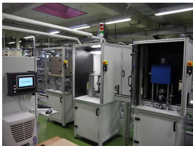
Conventional end-of-line quality inspection system

2. Advanced control and supervision of the whole production line is aimed at finding causes of shortcomings/errors detected by End-of-line quality inspection system. In this way, detection or forecast of possible faults already at early stage during production steps enable timely action or