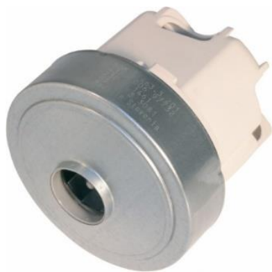
Example of an electric motor – subject of zero-defect manufacturing

Timely detection of faults or shortcomings in a production process is extremely important since it prevents faulty devices to be delivered to customers and built into appliances. Classification of possible shortcomings in a production process is equally important since it provides the possibility of identifying faulty workstations in a production process and repairing them. In both cases, waste of material, energy, labour and time is minimized.