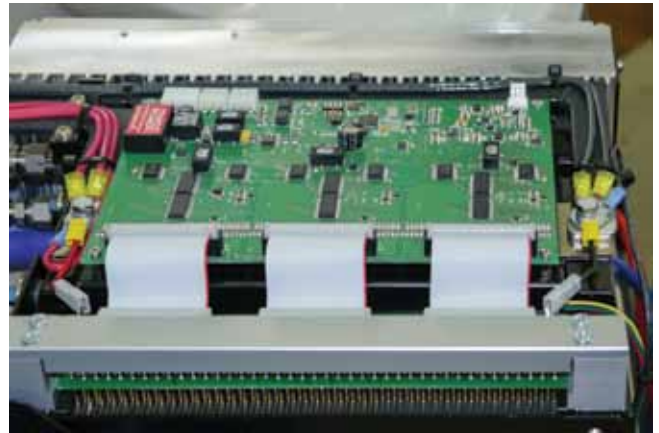
Figure 4: Diagnostic module for monitoring the fuel voltage of individual cells in a fuel-cell stack

Within the multidisciplinary project Ceracon- Integration and control of liquid fuel processor based on ceramic micro-systems which is financed by the European Space Agency we continued the development of the prototypes of critical components of the miniature size fuel reformer, which will serve as a source of hydrogen for miniature fuel cells. In 2012 we studied the efficiency of the reforming process as a function of the operating conditions and the type of catalyst.