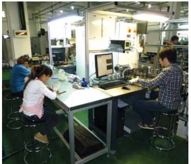
Figure 5: Diagnostic system for end quality control on the production line at Domel Electric Motors Suzhou Company Ltd.

At Domel Electric Motors Suzhou Company Ltd., China, a new diagnostic system for the end quality control of electrical motors was completed in 2012 (Figure 5). The new system is the seventh in the series of similar, very successful diagnostic systems used in Domel.