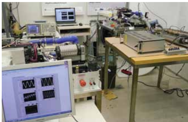
Figure 2: PEM fuel cells and measurement equipment during test operation

The sub-area tools and building blocks for implementation also included three parts. A method for the efficient control of under-damped systems has been developed. The method efficiently stabilizes systems in the open-loop and in the closed-loop configurations. In the frame of research dealing with tools and methodologies for process control software synthesis the work on a model-driven methodology for industrial process control software development