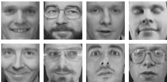
Fig. 1. Examples of the pre-processed images from the ORL database

To ensure that the face recognition performance of the tested techniques is not affected by factors not related to the face, e.g., hair style or background, a pre-processing procedure was applied to all the images from the database. The procedure first aligned, i.e., rotated and scaled, the images in such a way that the eye-centers were located at pre-defined position 2 , then cropped the face-region to a fixed size of 64 \times 64 pixels and finally used a photometric normalization technique to reduce the impact of the lighting conditions present during the image-acquisition stage on the appearance of the images. Some examples of the pre-processed images from the ORL database are shown in Fig. 1.