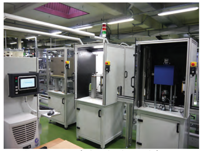
Figure 4: Diagnostic system for the total quality control of eco-motors on

For another on-going Slovenian Research Agency project Development and implementation of a method for on-line modelling and forecasting the new production line ML-13 in Domel d.o.o. of air pollution a procedure for on-line Gaussian-Process modelling for