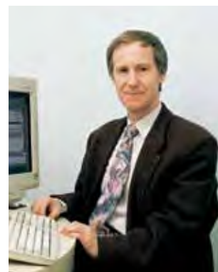
Head: Prof. Stanislav Strmčnik

The sub-area tools and building blocks for implementation also included three parts. The first part of our work was devoted to a further development of the program package for rapid prototyping of advanced control algorithms. In the past year the package was enhanced by algorithms for the detection of the non-linearity and tuning of multivariable controllers.