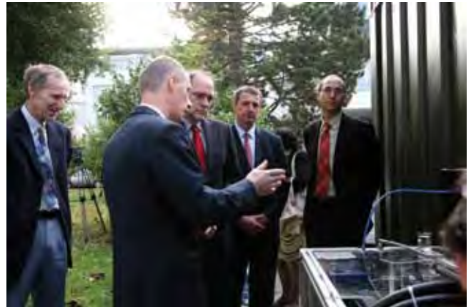
Figure 4: Presentation of the mobile-dwelling cogeneration unit to the Slovenian Minister for Development and European Affairs, Mitja Gaspari M. Sc.; at the JSI, October 2009

Our department members taking part in the project entitled “Development of demonstration prototype of mobile cogeneration fuel cell based system for military purposes” were given an award by the Ministry of Defense of the Republic of Slovenia and the Slovenian Technology Agency for a very successful project implementation.