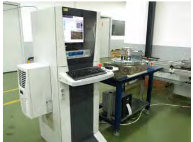
Figure 5: Diagnostic system for electronically commutated motors.